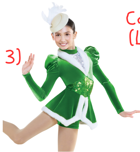
Company (Level 4 & 5)